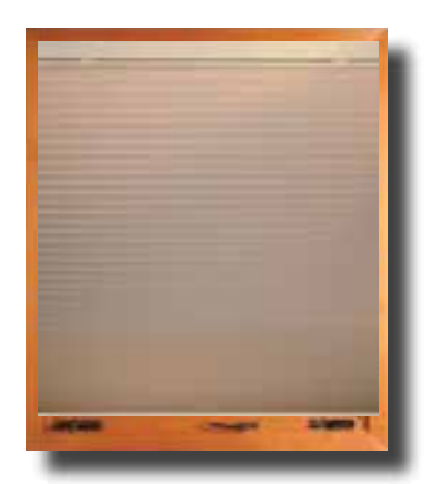
SHADE HITS OBSTRUCTION WHILE LOWERING, with SMART ^{ ext{ iny 8}} SYSTEM