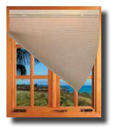
Shade raised after hitting obstruction, \textit{without} \ \ \mathbf{SMART}^{\circledR} \ \ \mathbf{SYSTEM}