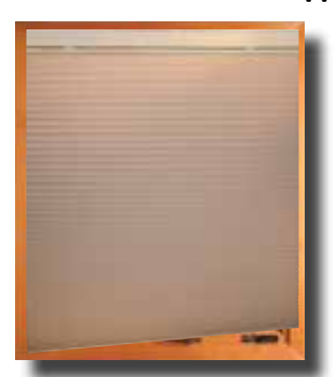
Shade hits obstruction while lowering, without \; { t SMART}^{ ext{ iny B}} \; { t SYSTEM}